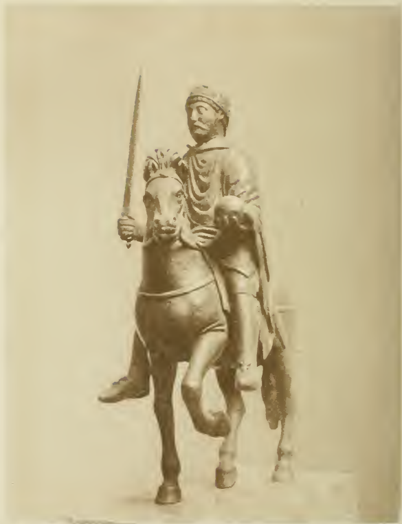
Charlemagne Iron & bronze statuette in the Musée Carnavalet, Paris